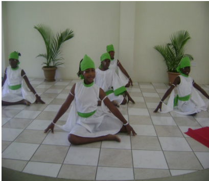
Dance piece by Questelles Government School

The curtains came down, with a big applause, for another of the Ministry of Education's annual Christmas Music Festival. Wednesday, 10th December 2008; marked the successful end of the nation-wide talent exhibition.