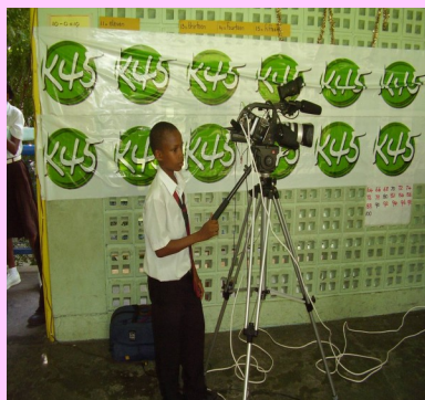
A budding Cameraman

Participating Agencies included tertiary educational institutions, the Private Sector (Commercial Banks and other private companies) and the Public Sector