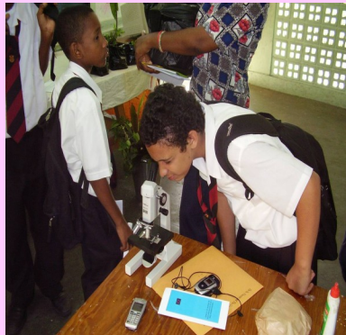
A potential Plant Pathologist ?

The main purpose of the Career Fair was to give interested students, as well as potential employees and members of the general public, the opportunity