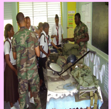
Demonstration by SVG Police Force