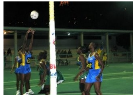
Team SVG in Netball action

The Ministry of Education invested a total cost of US$54,000 in the training programme.