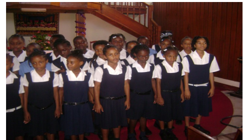
Students of the Calliaqua Anglican School performing set piece

The Ministry of Education will continue to organize the annual Christmas Music Festival.