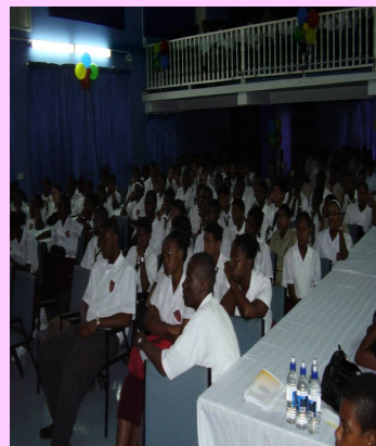
Students listen attentively to lecture

The main purpose of the Career Fair was to give interested students, as well as potential employees and members of the general public, the opportunity